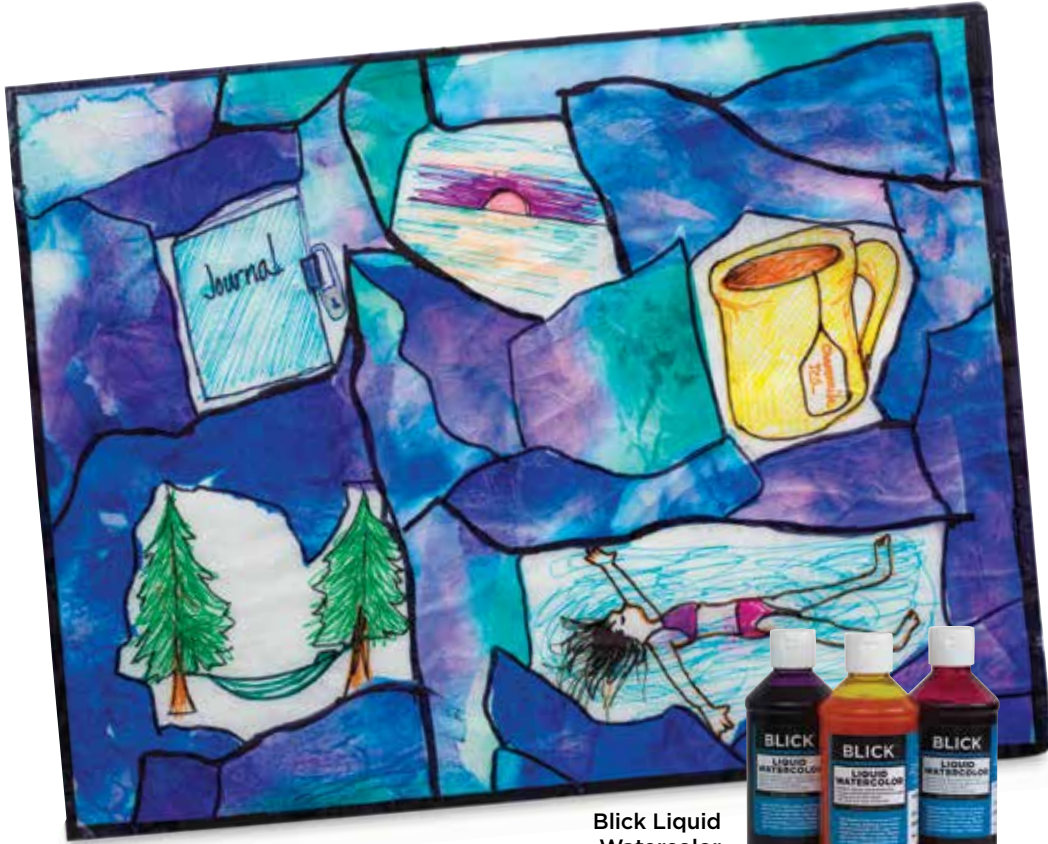
Blick Liquid Watercolor Item #00369